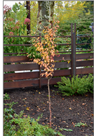
Milk And Honey Japanese Stewartia in fall