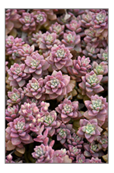
California Sunset Graptosedum foliage

California Sunset Graptosedum is a dense herbaceous evergreen perennial with an upright spreading habit of growth. Its medium texture blends into the garden, but can always be balanced by a couple of finer or coarser plants for an effective composition.