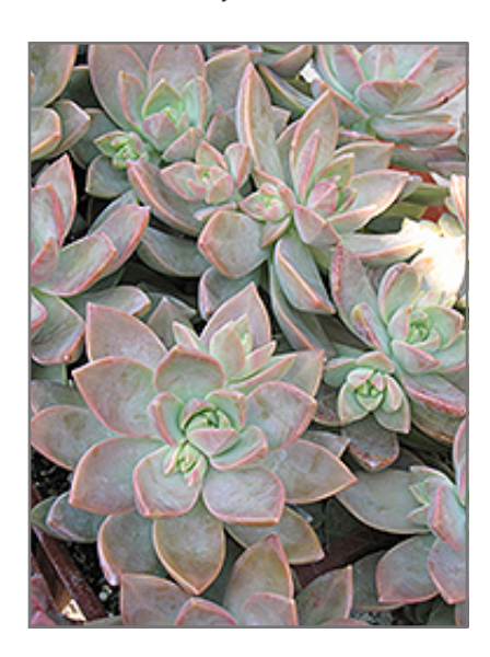
California Sunset Graptosedum