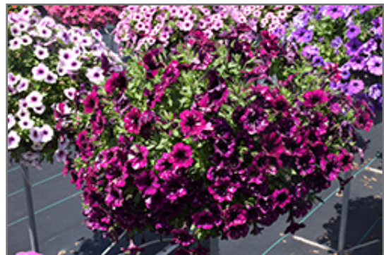
Splash Dance Magenta Mambo Petunia in bloom