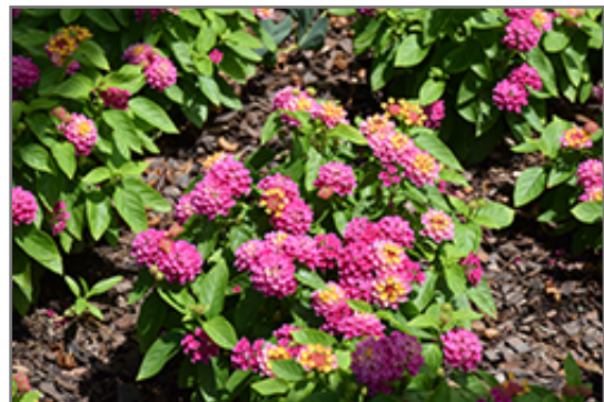
Gem Compact Pink Opal Lantana flowers