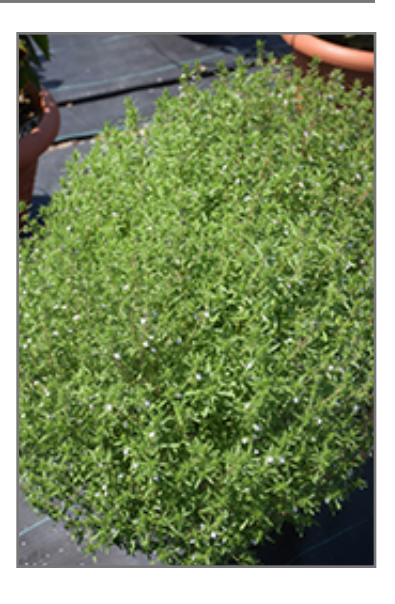
Nana Dwarf Winter Savory

Aside from its primary use as an edible, Nana Dwarf Winter Savory is sutiable for the following landscape applications;