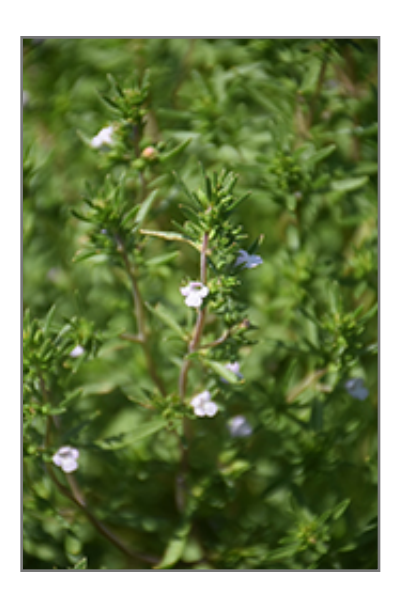
Nana Dwarf Winter Savory flowers