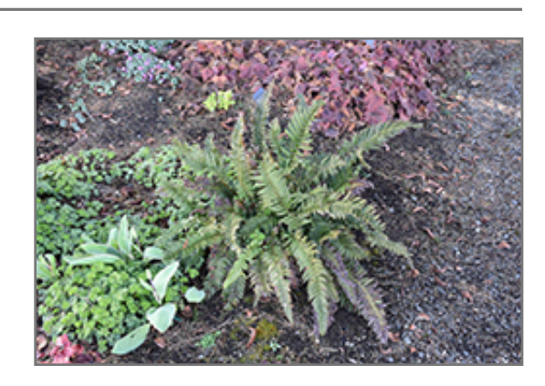
Shiny Holly Fern

Dark green, clean, shiny foliage with rigid edges, and coppery-brown scales on emerging fronds; excellent massed or as groundcover in shaded woodland borders or featured in shady areas of rock gardens