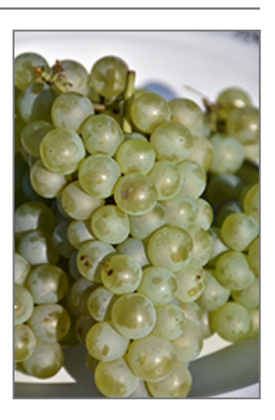
Okanagan Riesling Grape fruit