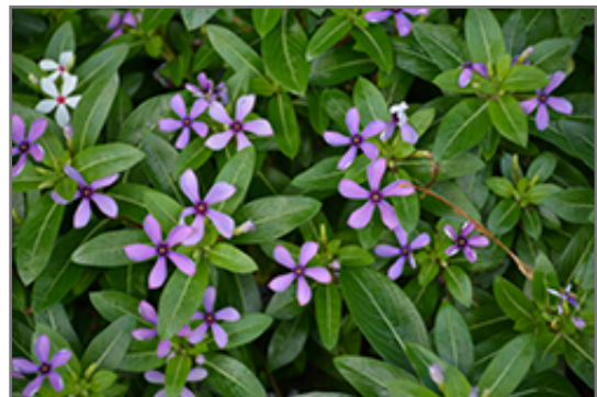
Soiree Kawaii Blueberry Kiss Vinca flowers