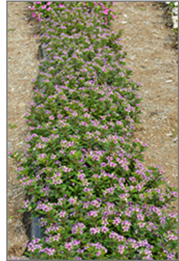
Soiree Kawaii Blueberry Kiss Vinca in bloom

Soiree Kawaii Blueberry Kiss Vinca is a fine choice for the garden, but it is also a good selection for planting in outdoor containers and hanging baskets. Because of its trailing habit of growth, it is ideally suited for use as a 'spiller' in the 'spiller-thriller-filler' container combination; plant it near the edges where it can spill gracefully over the pot. Note that when growing plants in outdoor containers and baskets, they may require more frequent waterings than they would in the yard or garden.