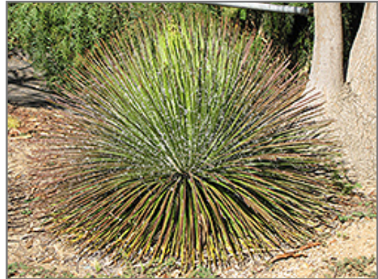
Narrowleaf Yucca

Narrowleaf Yucca is recommended for the following landscape applications;