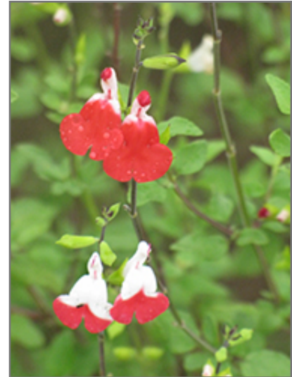
Little Kiss Sage flowers

Little Kiss Sage is recommended for the following landscape applications;