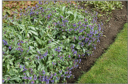
Trevi Fountain Lungwort in bloom

Trevi Fountain Lungwort will grow to be about 12 inches tall at maturity, with a spread of 18 inches. When grown in masses or used as a bedding plant, individual plants should be spaced approximately 15 inches apart. Its foliage tends to remain dense right to the ground, not requiring facer plants in front. It grows at a medium rate, and under ideal conditions can be expected to live for approximately 10 years. As an herbaceous perennial, this plant will usually die back to the crown each winter, and will regrow from the base each spring. Be careful not to disturb the crown in late winter when it may not be readily seen!