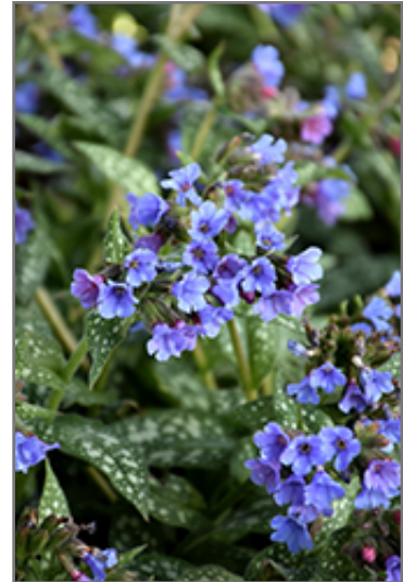
Trevi Fountain Lungwort flowers