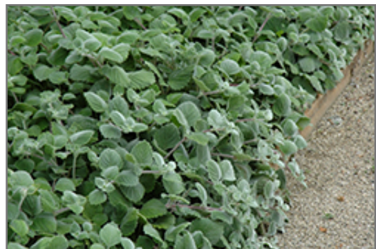
Silver Crest Plectranthus