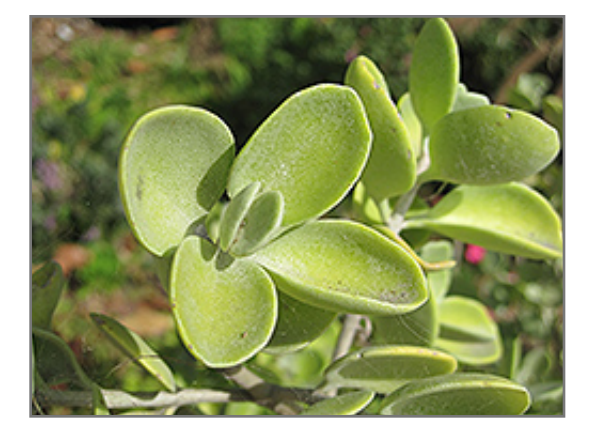
Silver Teaspoons foliage

A compact, shrubby succulent featuring light green, spoon shaped leaves that are oppositely arranged, covered with silvery fuzz and a waxy coating; red flowers on branched stalks in summer; great for containers and rock gardens, or as a small border hedge