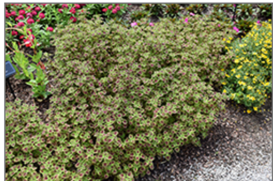
ColorBlaze Chocolate Drop Coleus