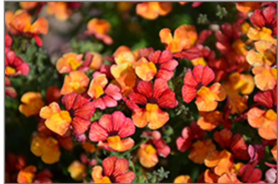
Babycakes Little Orange Nemesia flowers

Babycakes Little Orange Nemesia is recommended for the following landscape applications;