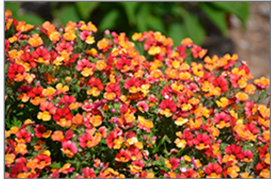
Babycakes Little Orange Nemesia flowers

Babycakes Little Orange Nemesia will grow to be about 8 inches tall at maturity, with a spread of 12 inches. When grown in masses or used as a bedding plant, individual plants should be spaced approximately 8 inches apart. Its foliage tends to remain low and dense right to the ground. This fast-growing annual will normally live for one full growing season, needing replacement the following year.