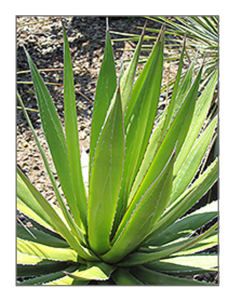
Masparillo foliage