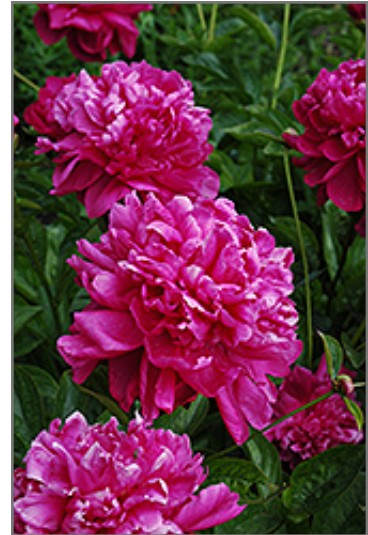
Music Man Peony flowers