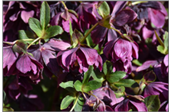
Winter Jewels Amethyst Gem Hellebore flowers