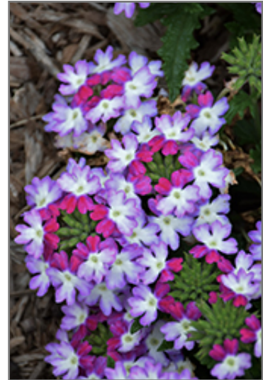
Hurricane Purple Blue Verbena flowers