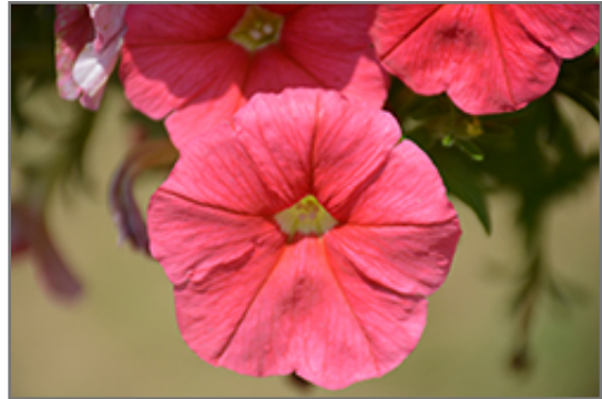
Sanguna Patio Salmon Petunia flowers