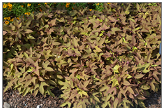
Sidekick Heart Bronze Sweet Potato Vine