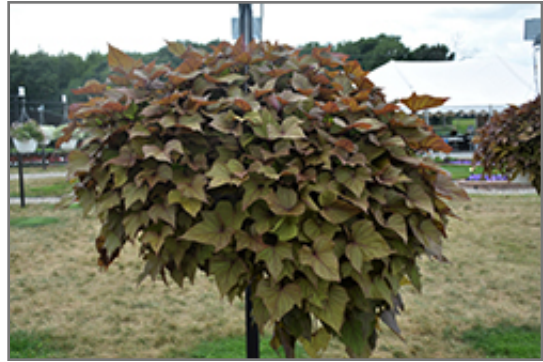
Sidekick Heart Bronze Sweet Potato Vine

Sidekick Heart Bronze Sweet Potato Vine is a fine choice for the garden, but it is also a good selection for planting in outdoor containers and hanging baskets. Because of its trailing habit of growth, it is ideally suited for use as a 'spiller' in the 'spiller-thriller-filler' container combination; plant it near the edges where it can spill gracefully over the pot. Note that when growing plants in outdoor containers and baskets, they may require more frequent waterings than they would in the yard or garden.