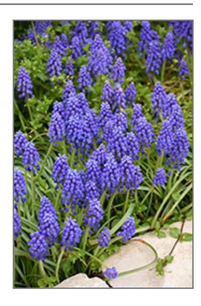
Grape Hyacinth flowers

This plant should only be grown in full sunlight. It does best in average to evenly moist conditions, but will not tolerate standing water. It is not particular as to soil type or pH. It is somewhat tolerant of urban pollution. This species is not originally from North America. It can be propagated by multiplication of the underground bulbs.