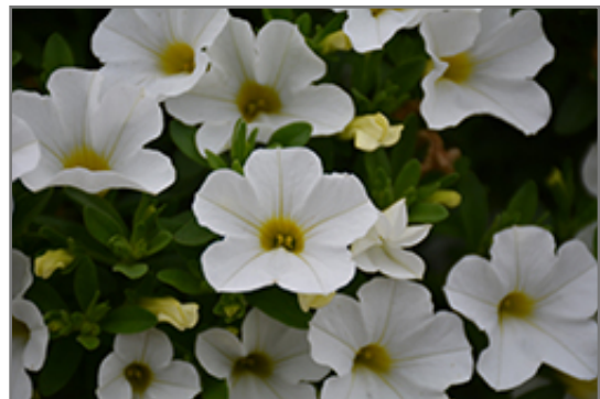
MiniFamous Uno White Calibrachoa flowers