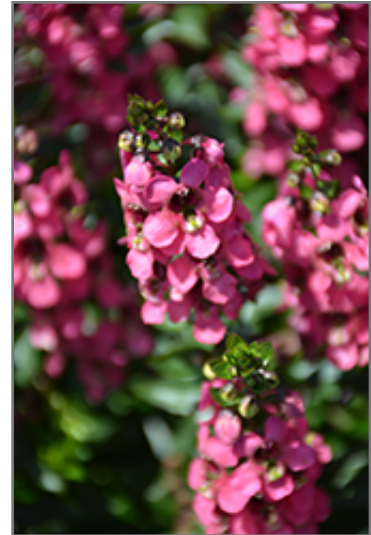
Serenita Rose Angelonia flowers

Serenita Rose Angelonia is recommended for the following landscape applications;