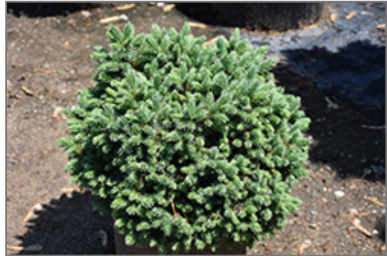
Jasper Engelmann Spruce