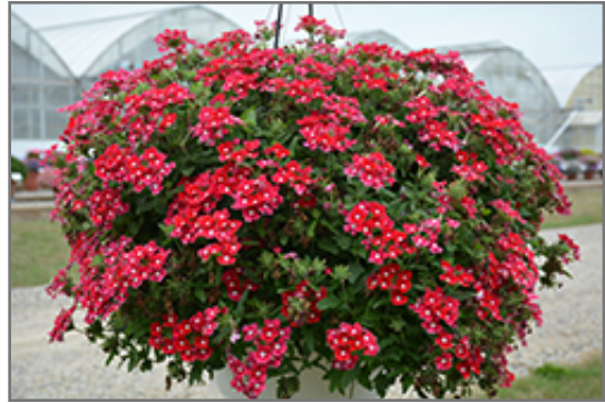
Cadet Upright Red Verbena in bloom

Cadet Upright Red Verbena is a fine choice for the garden, but it is also a good selection for planting in outdoor containers and hanging baskets. It is often used as a 'filler' in the 'spiller-thriller-filler' container combination, providing a mass of flowers against which the larger thriller plants stand out. Note that when growing plants in outdoor containers and baskets, they may require more frequent waterings than they would in the yard or garden.