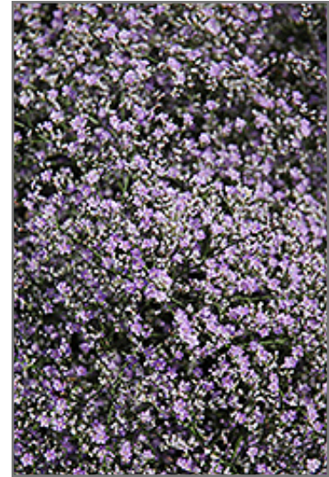
Sea Lavender flowers