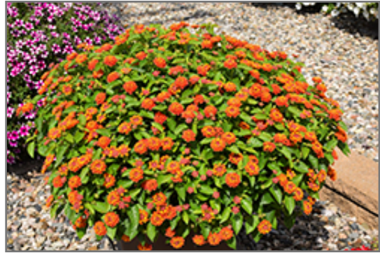
Hot Blooded Red Lantana in bloom

Hot Blooded Red Lantana is a fine choice for the garden, but it is also a good selection for planting in outdoor containers and hanging baskets. It is often used as a 'filler' in the 'spiller-thriller-filler' container combination, providing a mass of flowers against which the thriller plants stand out. Note that when growing plants in outdoor containers and baskets, they may require more frequent waterings than they would in the yard or garden.