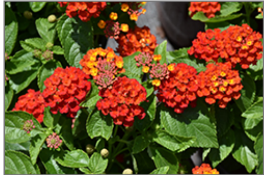
Hot Blooded Red Lantana flowers

Hot Blooded Red Lantana is recommended for the following landscape applications;