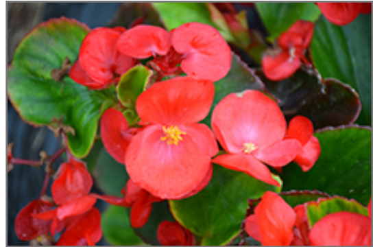
Topspin Scarlet Begonia flowers

Topspin Scarlet Begonia is recommended for the following landscape applications;