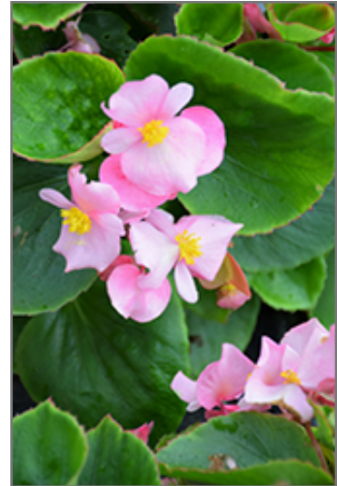
Topspin Pink Begonia flowers