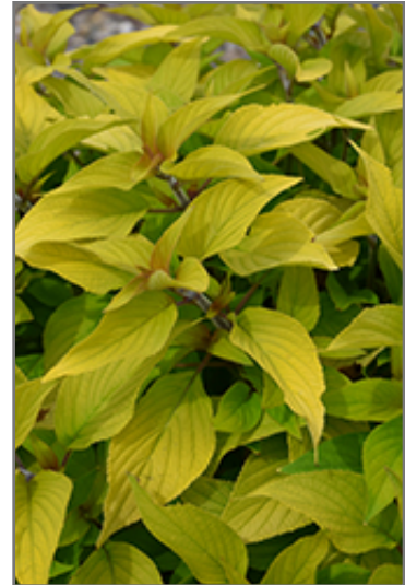
Rockin' Golden Delicious foliage