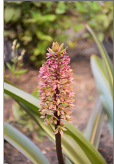
African Night Pineapple Lily flower buds