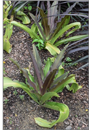
African Night Pineapple Lily

This plant is not reliably hardy in our region, and certain restrictions may apply; contact the store for more information.