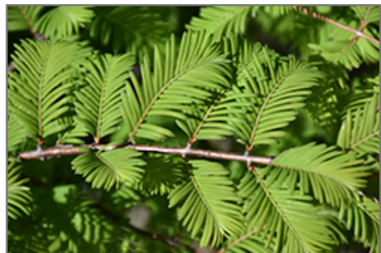
Jade Prince Dawn Redwood foliage