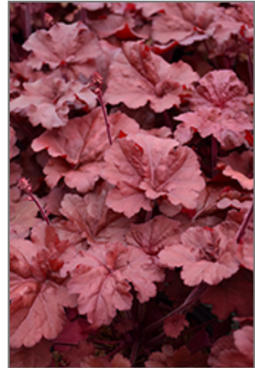
Primo Mahogany Monster Coral Bells foliage

Primo Mahogany Monster Coral Bells is a dense herbaceous evergreen perennial with tall flower stalks held atop a low mound of foliage. Its relatively fine texture sets it apart from other garden plants with less refined foliage.