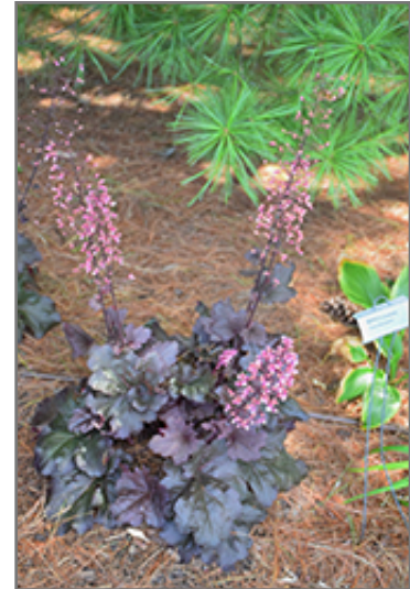
Primo Mahogany Monster Coral Bells in bloom

Primo Mahogany Monster Coral Bells is a fine choice for the garden, but it is also a good selection for planting in outdoor pots and containers. With its upright habit of growth, it is best suited for use as a 'thriller' in the 'spiller-thriller-filler' container combination; plant it near the center of the pot, surrounded by smaller plants and those that spill over the edges. Note that when growing plants in outdoor containers and baskets, they may require more frequent waterings than they would in the yard or garden.