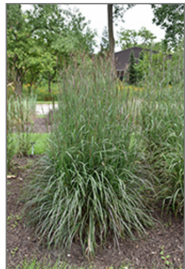
Blackhawks Bluestem in bloom