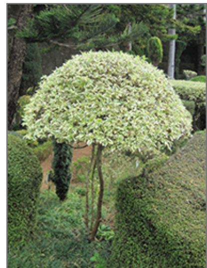
Snow Queen Hibiscus