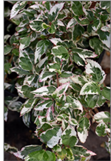
Snow Queen Hibiscus foliage

-- THIS IS A TROPICAL PLANT AND SHOULD NOT BE EXPECTED TO SURVIVE THE WINTER OUTDOORS IN OUR CLIMATE --