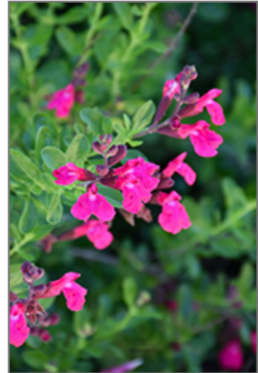
Mirage Hot Pink Autumn Sage flowers

Mirage Hot Pink Autumn Sage is an herbaceous evergreen perennial with an upright spreading habit of growth. Its medium texture blends into the garden, but can always be balanced by a couple of finer or coarser plants for an effective composition.