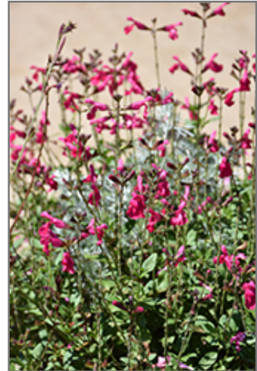
Mirage Hot Pink Autumn Sage flowers

This plant is not reliably hardy in our region, and certain restrictions may apply; contact the store for more information.