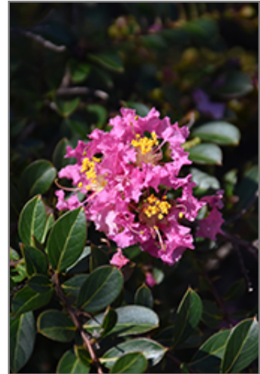
Princess Lyla Crapemyrtle flowers