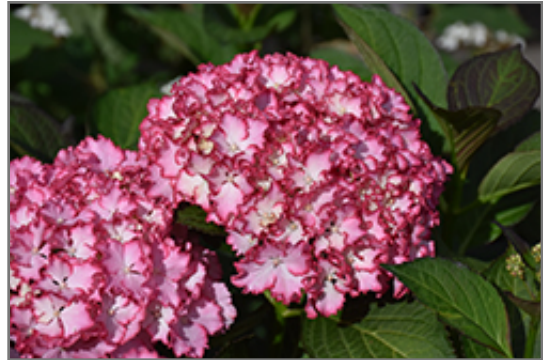
Seaside Serenade Fire Island Hydrangea flowers

Seaside Serenade Fire Island Hydrangea is recommended for the following landscape applications;