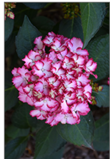
Seaside Serenade Fire Island Hydrangea flowers