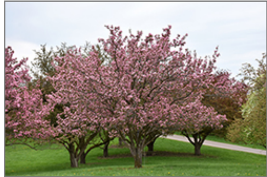
Sundog Flowering Crab in bloom