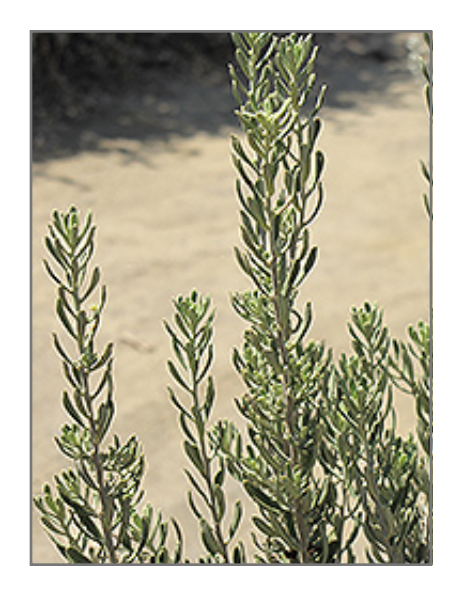
Houdini Sage foliage