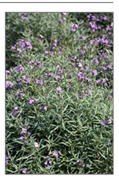
Bowles Me Away Wallflower flowers