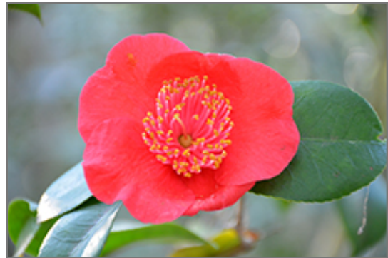
Hinomaru Camellia flowers

Hinomaru Camellia is recommended for the following landscape applications;