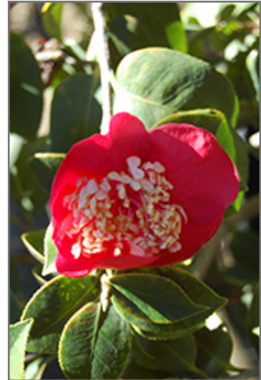
Hinomaru Camellia flowers

This plant is not reliably hardy in our region, and certain restrictions may apply; contact the store for more information.