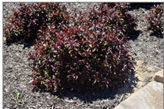
Colorstar Merlot Pink Weigela