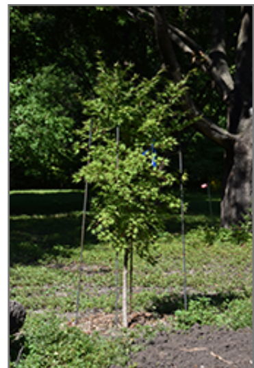
Jack Frost Avalanche Maple