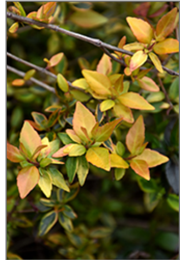
Gold Dust Abelia foliage