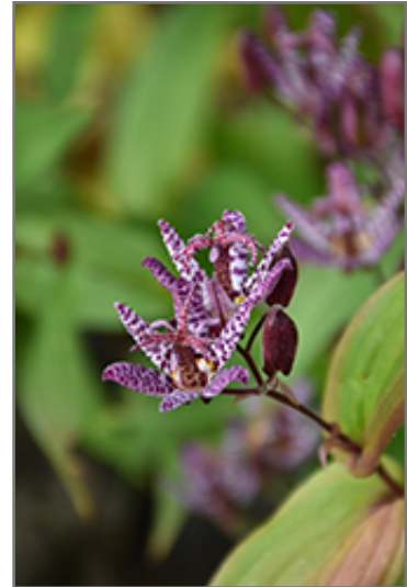
Toad Lily flowers