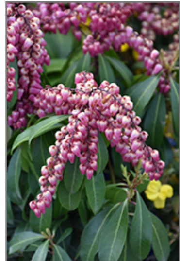
Enchanted Forest Impish Elf Japanese Pieris flowers

Enchanted Forest Impish Elf Japanese Pieris is recommended for the following landscape applications;