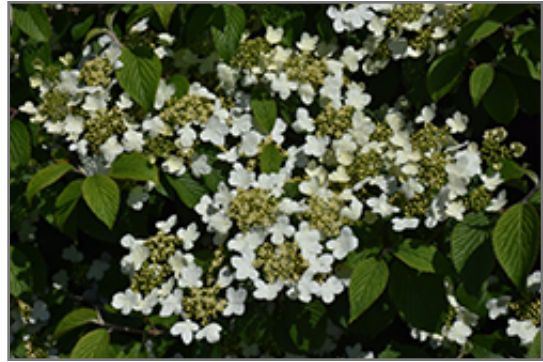
Wabi Sabi Doublefile Viburnum flowers

Wabi Sabi Doublefile Viburnum will grow to be about 3 feet tall at maturity, with a spread of 5 feet. When grown in masses or used as a bedding plant, individual plants should be spaced approximately 4 feet apart. It has a low canopy. It grows at a medium rate, and under ideal conditions can be expected to live for 40 years or more.