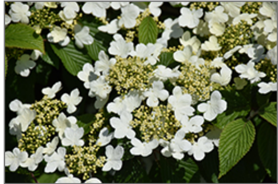
Wabi Sabi Doublefile Viburnum flowers

This is a relatively low maintenance shrub, and should only be pruned after flowering to avoid removing any of the current season's flowers. It is a good choice for attracting birds to your yard, but is not particularly attractive to deer who tend to leave it alone in favor of tastier treats. It has no significant negative characteristics.