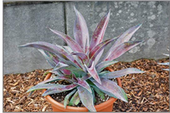
Mission to Mars Mangave

Mission to Mars Mangave will grow to be about 10 inches tall at maturity, with a spread of 22 inches. It grows at a fast rate, and under ideal conditions can be expected to live for approximately 5 years. As an herbaceous perennial, this plant will usually die back to the crown each winter, and will regrow from the base each spring. Be careful not to disturb the crown in late winter when it may not be readily seen!